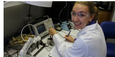
Novilase is an interstitial laser therapy system to treat breast tumors. The hope is that it will replace lumpectomy procedures as a minimally invasive standard of care for the removal of small tumors.