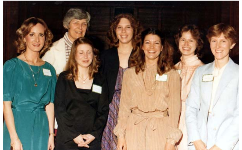
1982 Charter Members